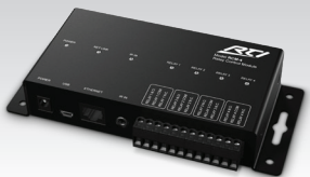
RCM-4 Relay Control Module