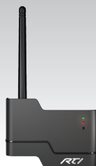
ZM-24 2.4GHz Zigbee® Transceiver