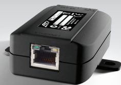
ESC-2 Ethernet to Serial Converter