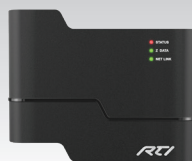
ZW-9 Z-Wave® Interface Module