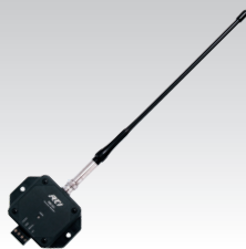
RM-433 433MHz RF Antenna