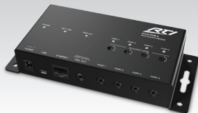
PCM-4 Port Control Module