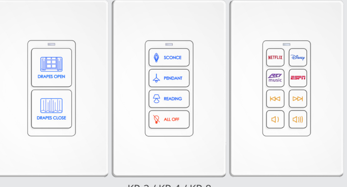
$\operatorname{KP-2}/\operatorname{KP-4}/\operatorname{KP-8}$ with Decora® style wall plate (not included)