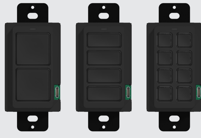
KP-2 / KP-4 / KP-8 in black